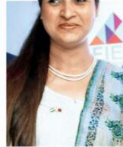
DELHI 6: Chandni Chowk MLA Alka Lamba